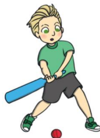
Bat the ball