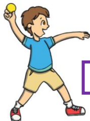
Throw the ball