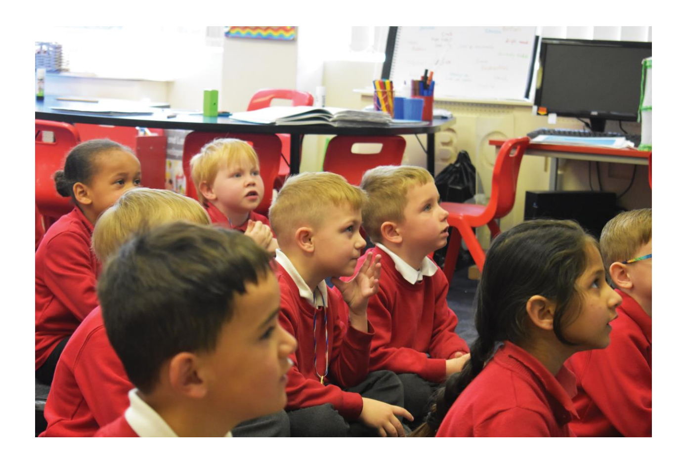
There is an expectation that children are in school everyday!

Education is not optional! There is an expectation that children are in school everyday!