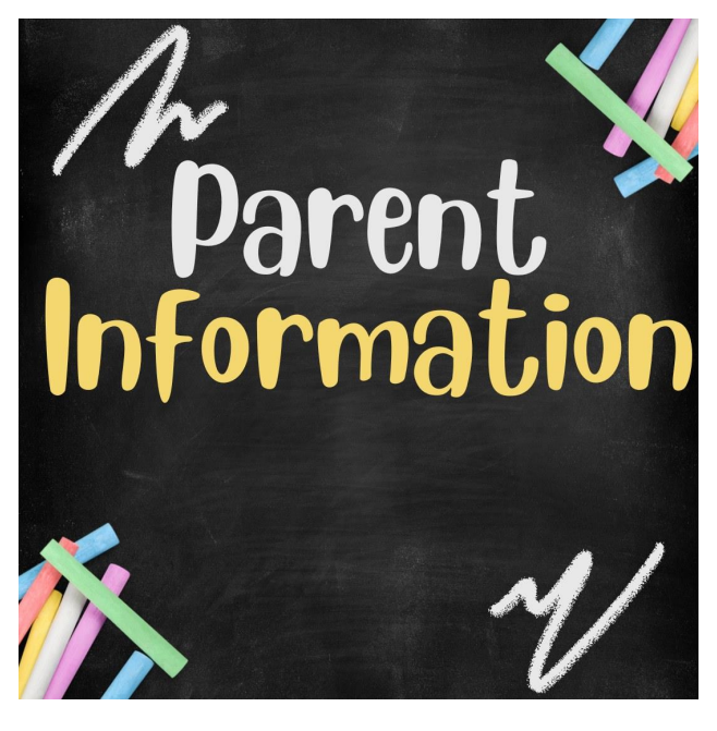
1 - Accurate information is a key part to motivation