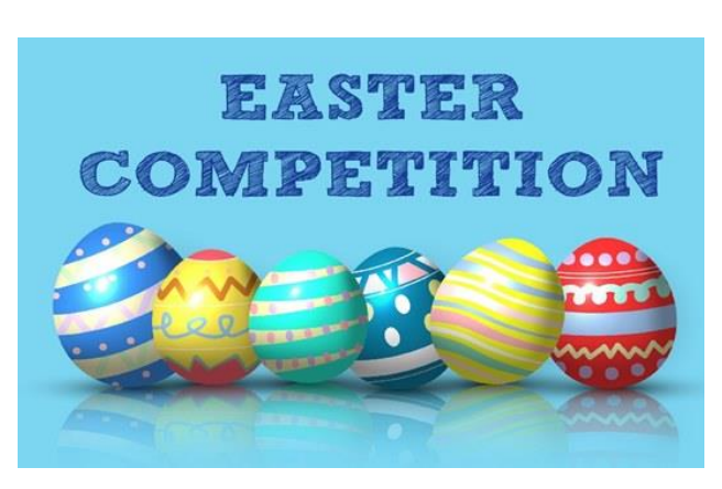
2 - Decorating Ideas