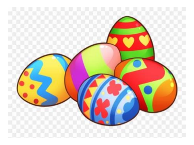
3 - Decorating Ideas